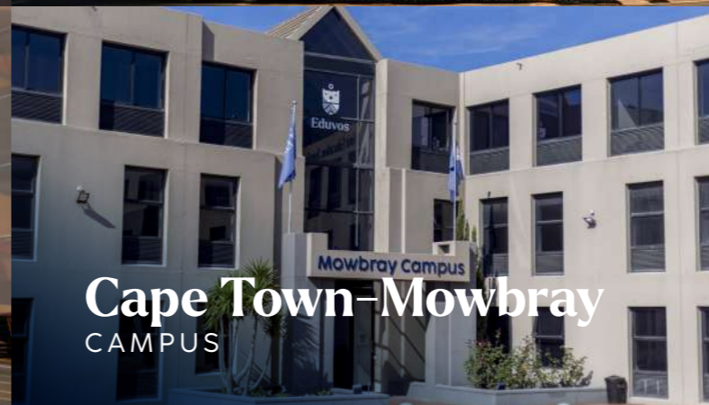
Cape Town-Mowbray CAMPUS