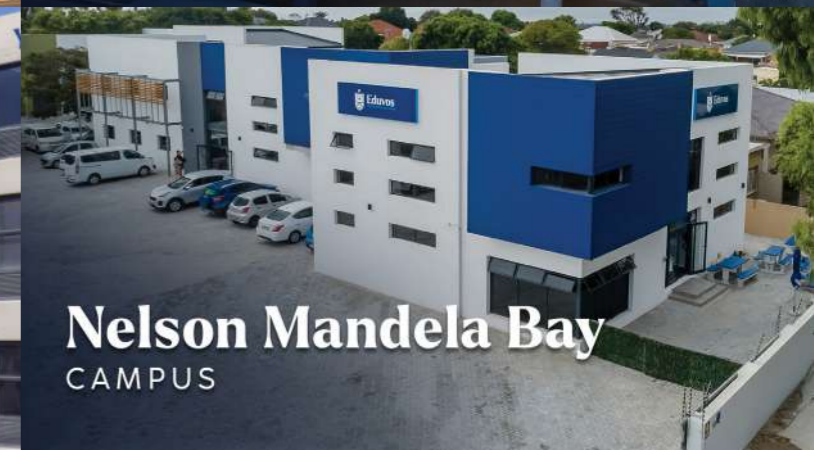
Nelson Mandela Bay CAMPUS