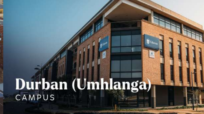
Durban (Umhlanga) CAMPUS