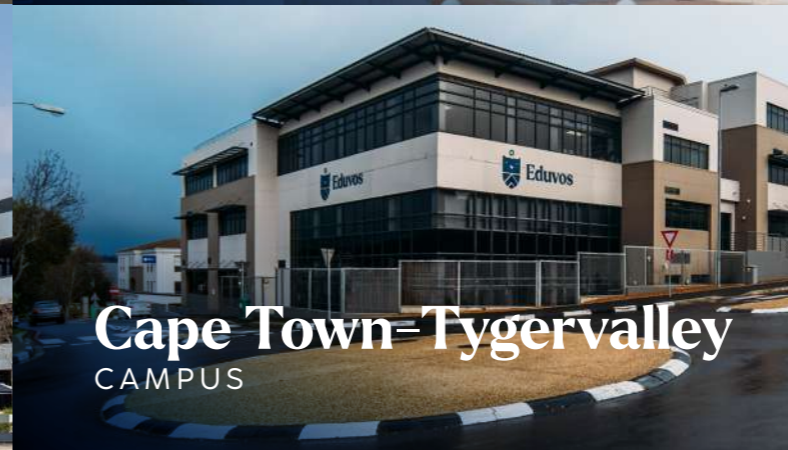
Cape Town-Tyger Valley CAMPUS