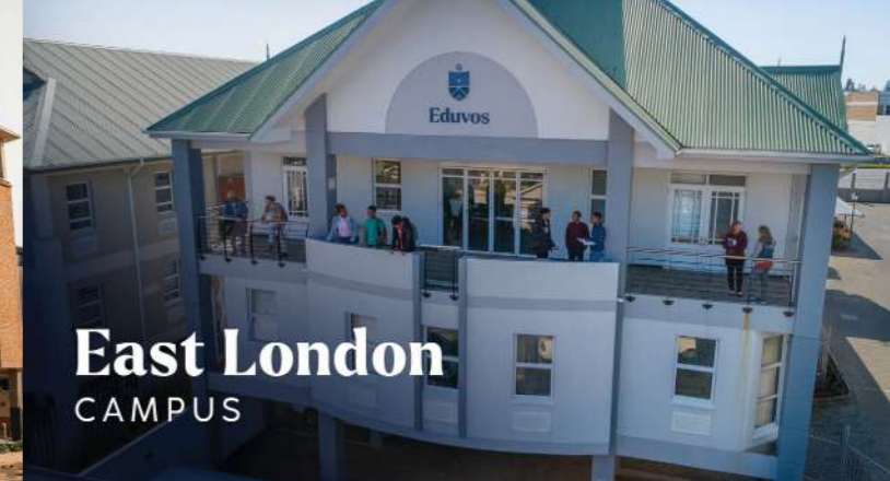
East London CAMPUS